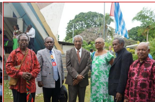
After the flag raising ceremony