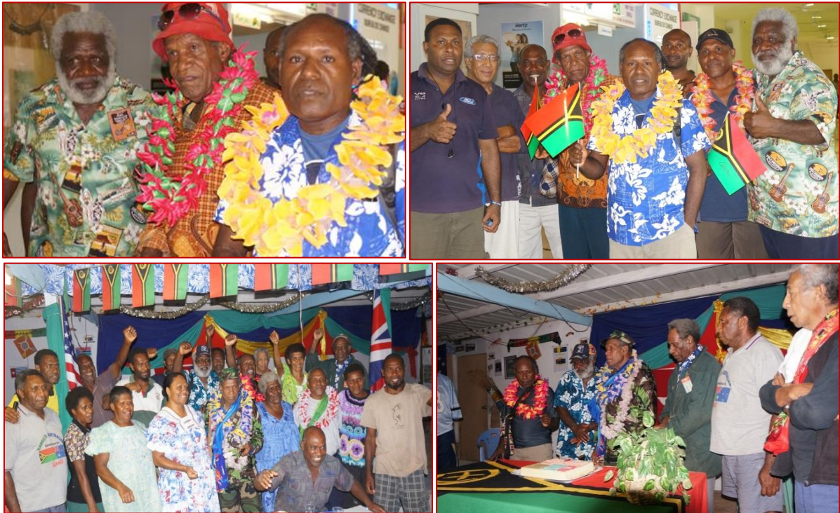
On arrival, Fete Association welcomed the delegation at the Airport and later hosted a dinner where the Chiefs performed a traditional ceremony to cement unity between both peoples, Ni-Vanuatu and West Papuans. The TPN Commander (with red cap) as guest of honour was invited to cut the cake for the ritual. Fete Association had been active in public actions to show solidarity with West Papua.