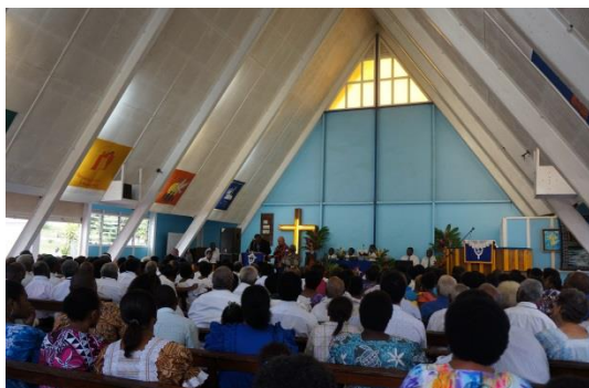
The Chairman, addressing the Congregation.