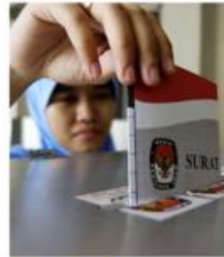
RIGHTS NOW 9-POINT HUMAN RIGHTS AGENDA FOR INDONESIA'S ELECTION CANDIDATES